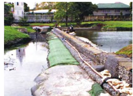
Installation of the Gabion above the Geotube® engineered tubes