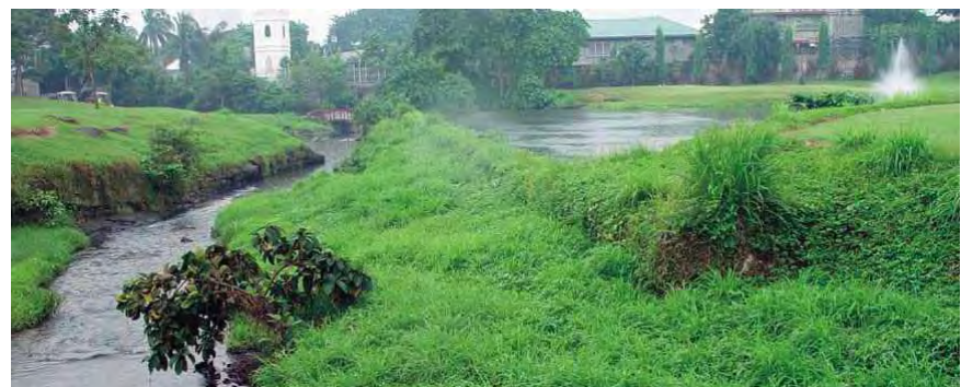
Fully vegetated structure as it is today

Geotube® is a registered trademark of TenCate.